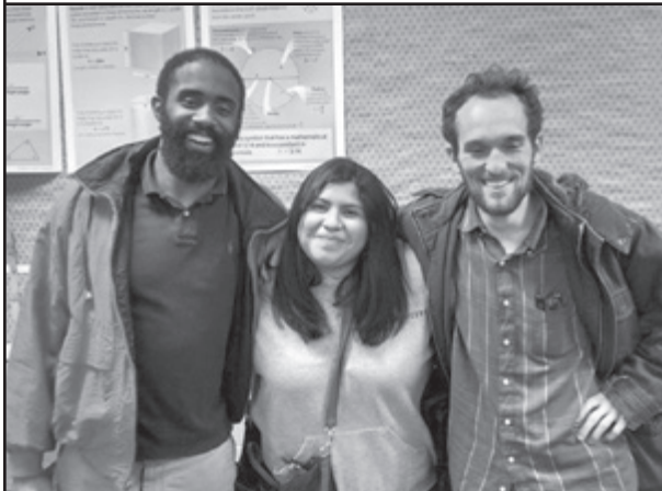
Youth Facilitators in Atlanta, Georgia