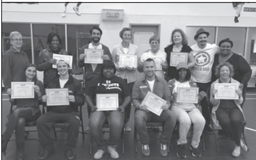
Congratulations to the latest graduates of the AVP-NJ Basic workshop in Neptune City! A wonderful weekend!

I arrived after a long train ride from the airport, feeling very much an alien in a strange land, wandering the large campus of Regis University in search of the site of the National Gathering. Forty-five minutes later, I stumbled upon it and never looked back. In light of recent events, it seemed like this year’s theme, “From Retribution to Restoration,” was Polyanna-ish. How will we ever create “restoration” in light of murders by police of civilians, especially young black men, and of retributive murders of police officers?