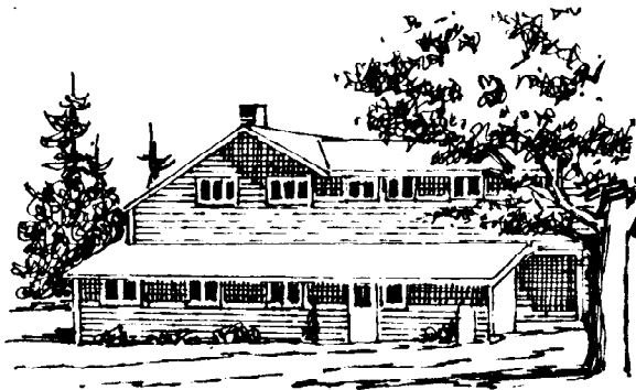
The Anna Curtis Center

AVP ANNUAL MEETING AT POWELL HOUSE SEPTEMBER 12-14, 1986